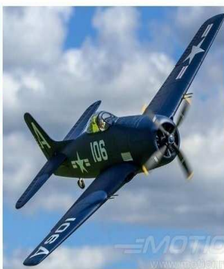
FLIGHTLINE F8F BEARCAT