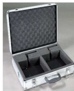
DUAL TRAMITTER CAASE

NOTE: OFFICIAL ASTRO WINGS FLIER TO FOLLOW