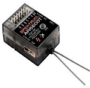
SPEKTRUM 6CH TELEMETRY REC.V.