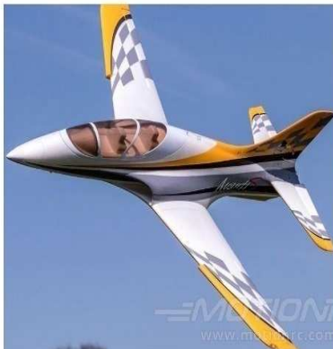
AVANTI & 6S4000MA BATTERY